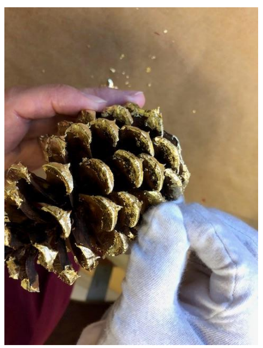
Buffing the leaf with your gloves

With gloved hands, Drape a piece of leaf over the cone and add leaf as needed to cover. You can use a soft brush or your gloved fingers to buff the leaf and remove excess. Be sure to save the flakes – they can be mixed for creating two-tone pine cones if desired!