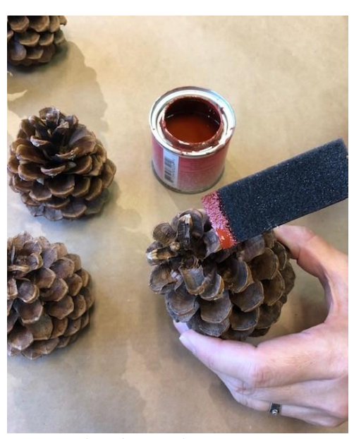
Priming with a vibrant red