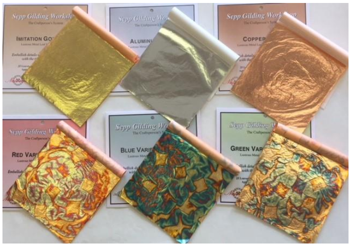
Sepp Gilding Workshop Leaf – Imitation Gold, Aluminum, Copper, and Red, Blue and Green Variegated

SGW also offers Red, Yellow and Gray primers, and Imitation Gold, Aluminum, Variegated Red, Blue and Green Leaf separately.