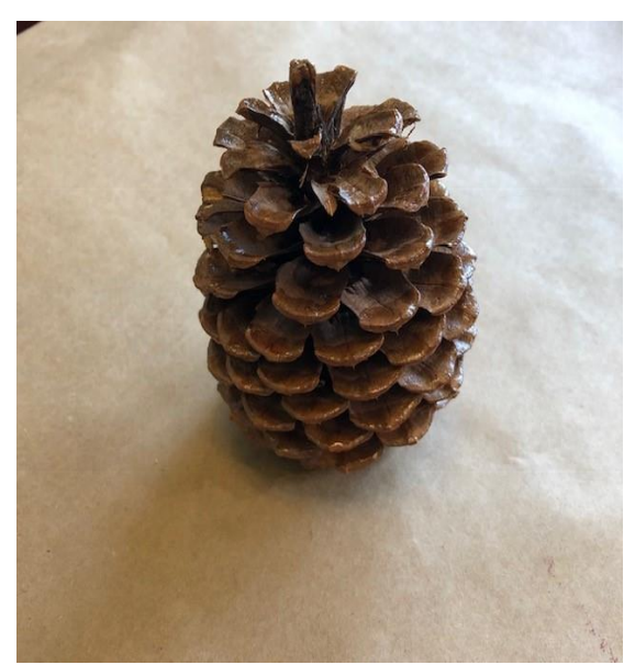
and turns clear and shiny as it reaches tack

Load your foam brush and apply enough SGW Water-Based Size to leave a white coating on each scale tip. The SGW Size will quickly shift from milky white to glossy and clear (in about 20