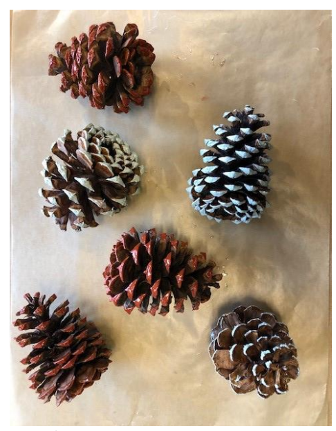
Primed pine cones

Using a foam brush, apply SGW Red primer for Imitation Gold, and Gray for the Imitation Silver. When the primer is dry, apply SGW oil-based Gilding Adhesive with a foam brush to the painted areas. Allow to come to tack (usually less than an hour). When it feels sticky but dry it's time to gild.