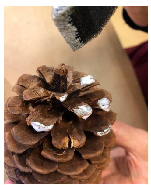
The size goes on milky white