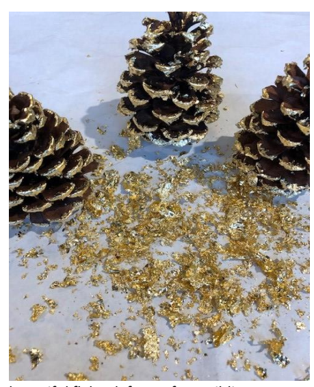
beautiful flakes leftover from gilding

With gloved hands, lift a piece of your Imitation Gold or Imitation Silver leaf over the pine cone, wrapping it like a blanket. Repeat as necessary to envelope the pine cone. Press to ensure full contact. Buff down the excess with a soft brush or by rubbing gently with your gloved hands. Flakes of excess leaf can be used to gild more pine cones or decorate another project!